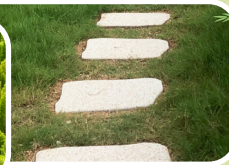
狗牙根(百慕達草) Cynodon dactylon (Bermuda Grass)