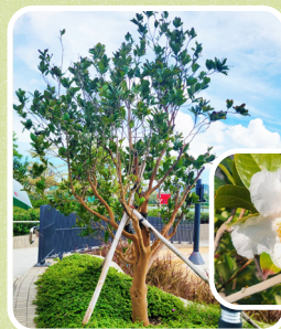
紅皮糙果茶 Camellia crapnelliana