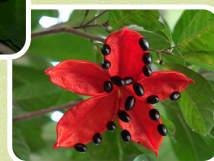
假蘋婆 Sterculia lanceolata