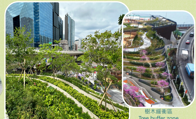
樹木緩衝區 Tree buffer zone