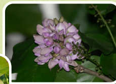
水黃皮 Pongamia pinnata